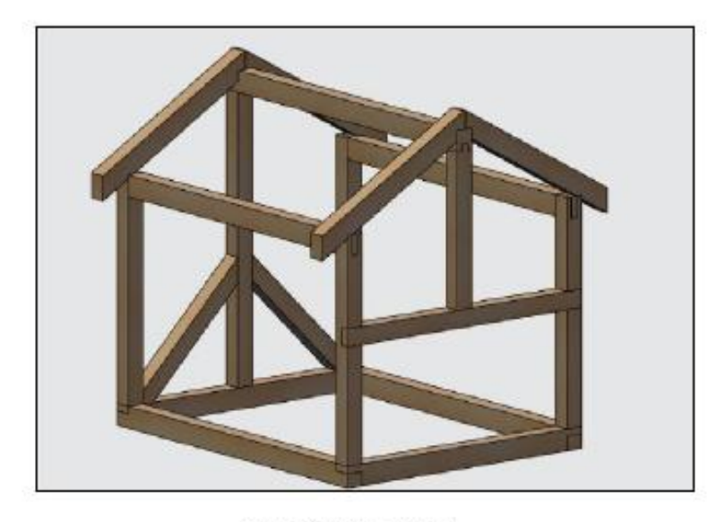
3 D VIEW