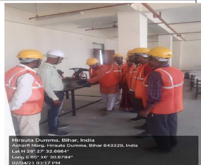
Hirauta Dumma, Bihar, India Asharfi Marg, Hirauta Dumma, Bihar 843329, India Lat N 26° 27' 32.6664" Long E 85° 16' 30.8784" 02/04/21 03:17 PM