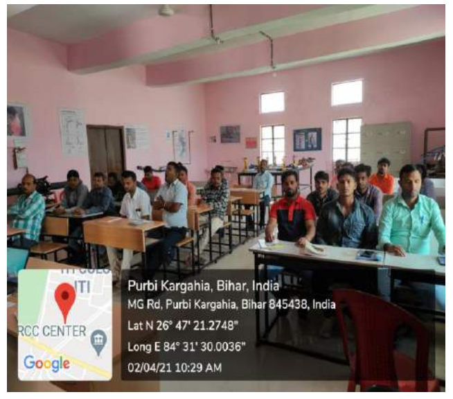
Purbi Kargahia, Bihar, India MG Rd, Purbi Kargahia, Bihar 845438, India Lat N 26° 47' 21.2748" Long E 84° 31' 30.0036" 02/04/21 10:29 AM