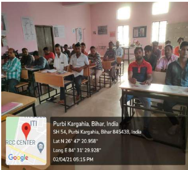
Purbi Kargahia, Bihar, India SH 54, Purbi Kargahia, Bihar 845438, India Lat N 26° 47' 20.958" Long E 84° 31' 29.928" 02/04/21 05:15 PM