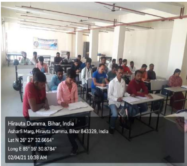
Hirauta Dumma, Bihar, India Asharfi Marg, Hirauta Dumma, Bihar 843329, India Lat N 26° 27' 32.6664" Long E 85° 16' 30.8784" 02/04/21 10:38 AM